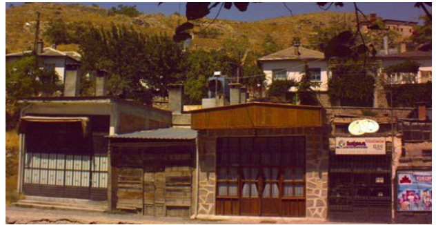
Figure 3. A part of Cumhuriyet Street (Scanner photo)