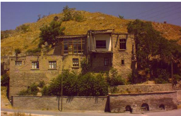
Figure 1. Priest House of Aya Elena Church (Scanner photo)