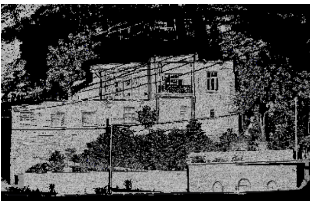
Figure 2. 3D point cloud of the house