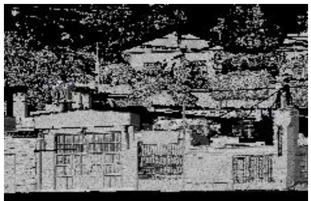
Figure 6. 3D Point cloud model