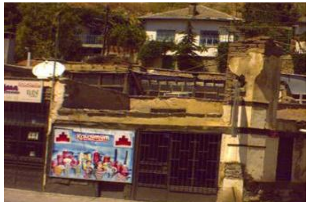
Figure 5. A part of Cumhuriyet street( Scanner photo)