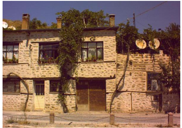
Figure 8-9. View from a part of street (Scan photos)