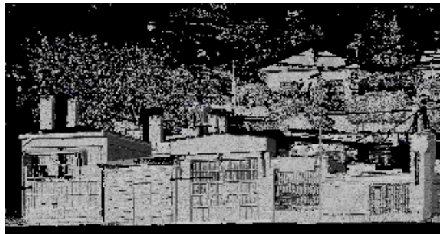
Figure 4. 3D point cloud model